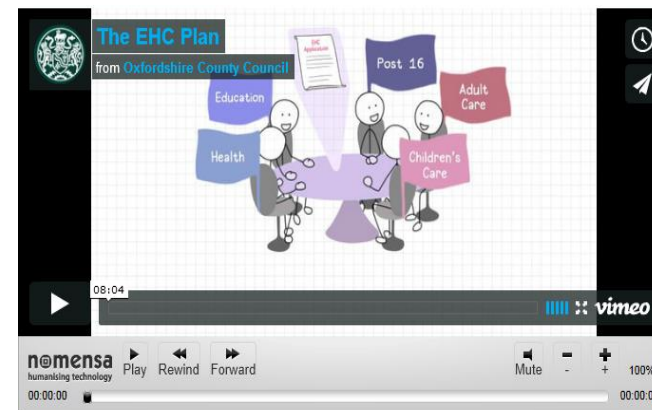
Animation to explain what happens at an Education, Health and Care Plan meeting

Oxfordshire Family Support Network have produced a guide for parents on Filling in the All about me section in an EHC plan.